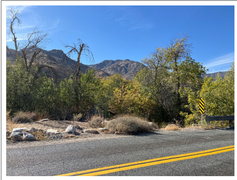
Photo 7: Riparian habitat located at the confluence of Cannell Creek and the Kern River.