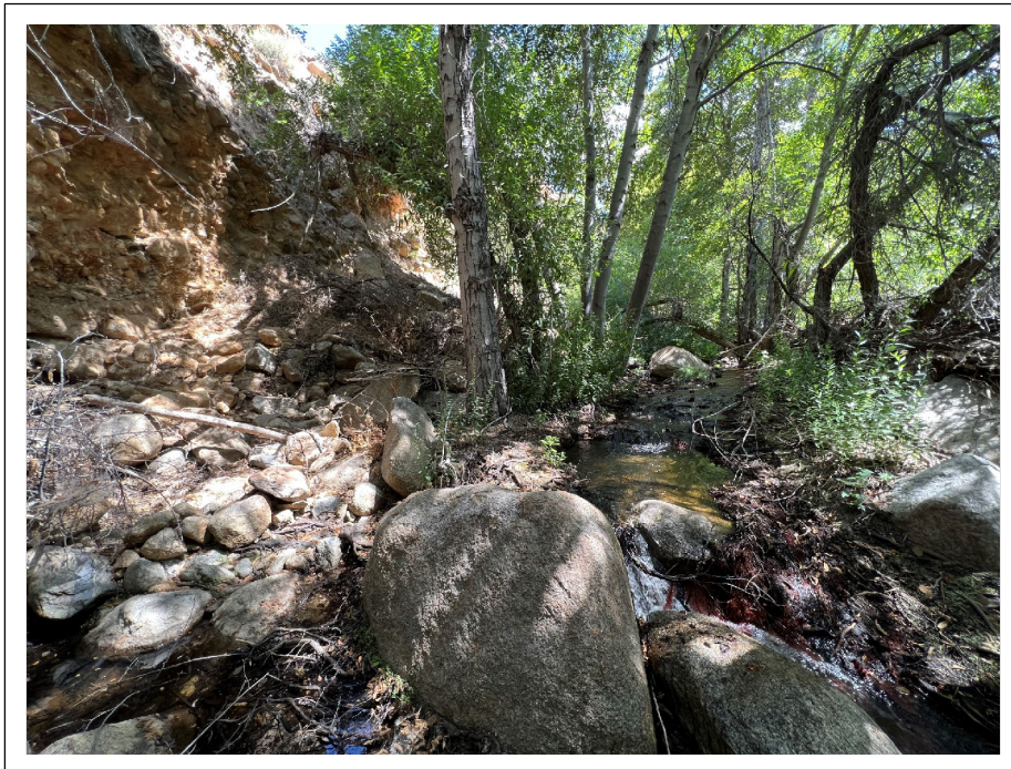
Photo 16: Woodland habitat with marginal foraging and resting habitat for dispersing Pacific fisher from Critical Habitat Unit 1 within Salmon Creek.

D:\Projects\3\ERM\Kern3\MXD\General_Wildlife\3ERM_8x11_SP_GW.mxd