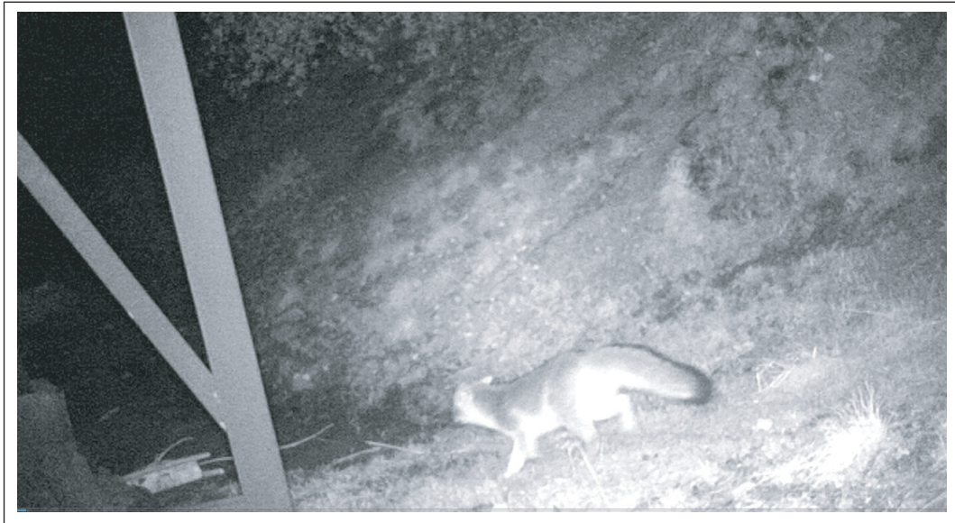
Photo 17: Common gray fox captured on wildlife camera 1, located along Salmon Creek on March 12, 2023.