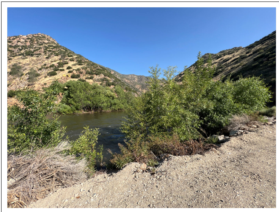
Photo 10: Riparian habitat located along the Kern River, located in the northern portion of the study area.

D:\Projects\3\ERM\Kern3\MXD\General_Wildlife\3ERM_8x11_SP_GW.mxd