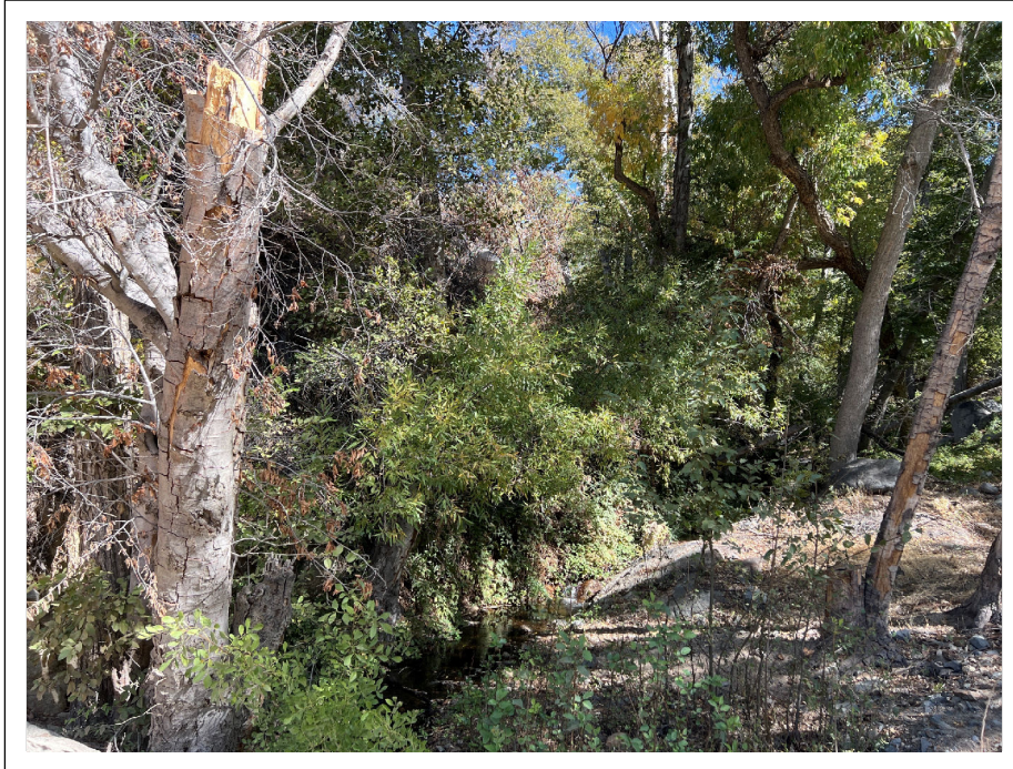
Photo 15: Woodland habitat with marginal foraging and resting habitat for dispersing Pacific fisher from Critical Habitat Unit 1 within Corral Creek.