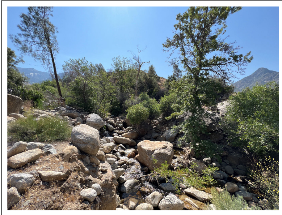
Photo 5: Riparian habitat located near the confluence of Corral Creek and the Kern River.