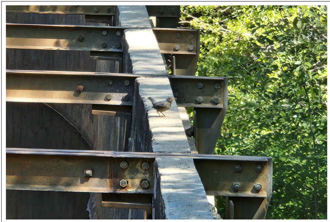
Photo 20: American dipper observed within Salmon Creek on Adit 8B/9A.