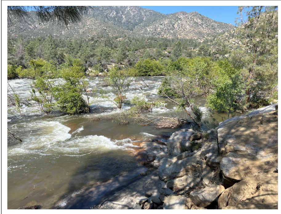
Photo 11: Riparian habitat located along the Kern River, located in the central portion of the study area.