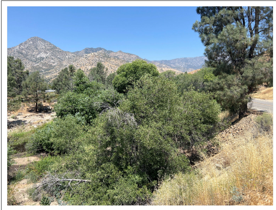
Photo 9: Riparian habitat located at the confluence of the Forebay and the Kern River.