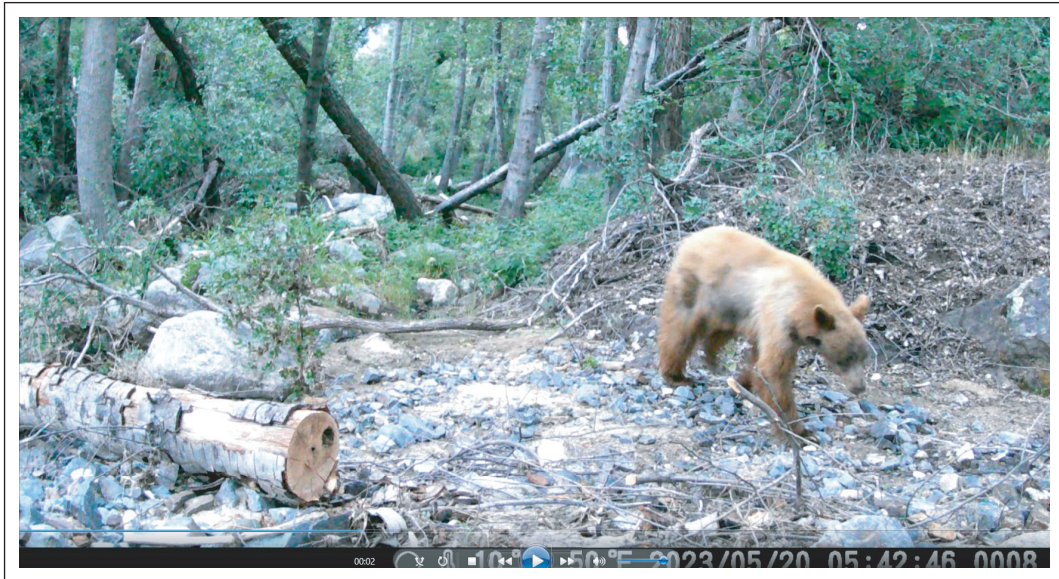
Photo 18: Black bear captured on wildlife camera 3, located along Corral Creek on May 20, 2023.