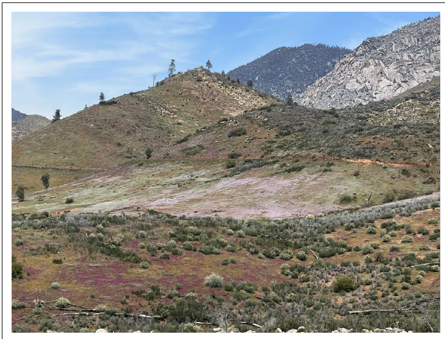
Photo 14: Grassland habitat suitable for California condor foraging, located in the southern portion of th study area, near Corral Creek.

D:\Projects\3\ERM\Kern3\MXD\General_Wildlife\3ERM_8x11_SP_GW.mxd