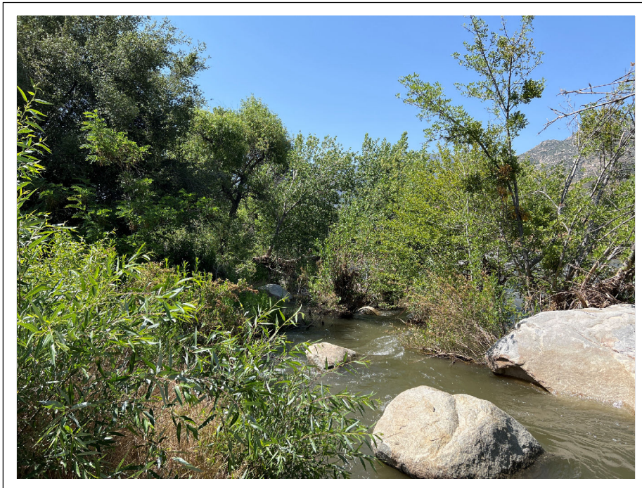
Photo 12: Riparian habitat located along the Kern River, located in the southern portion of the study area.

D:\Projects\3\ERM\Kern3\MXD\General_Wildlife\3ERM_8x11_SP_GW.mxd