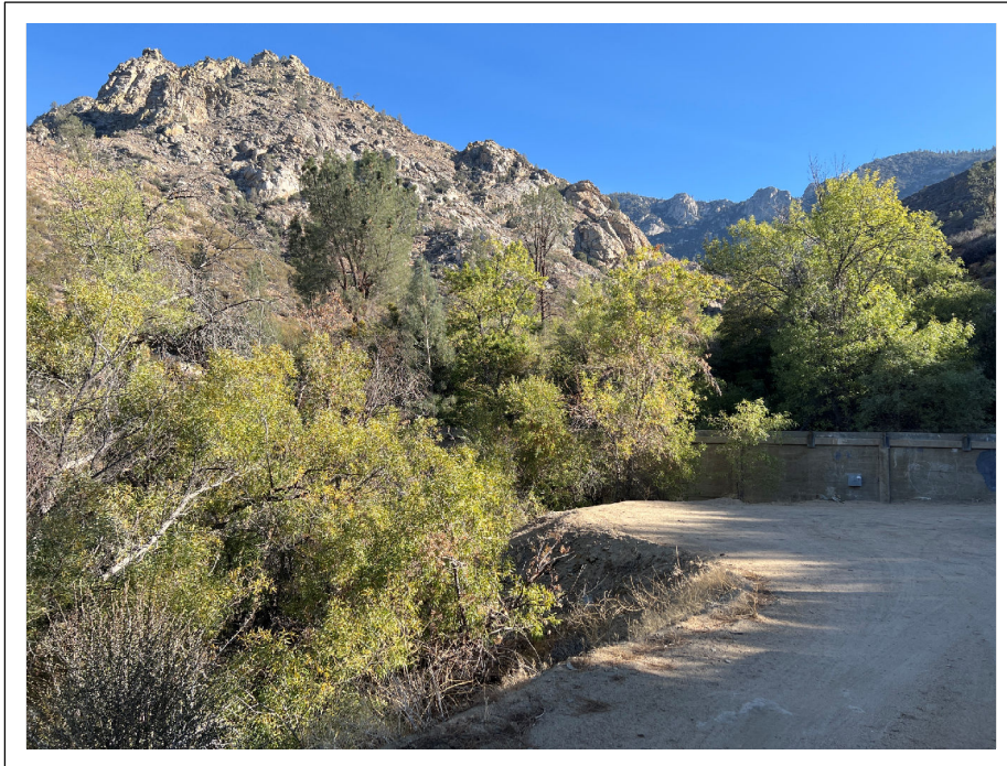
Photo 1: Riparian habitat located in Salmon Creek near the Salmon Creek flume and Adit 8B/9A.