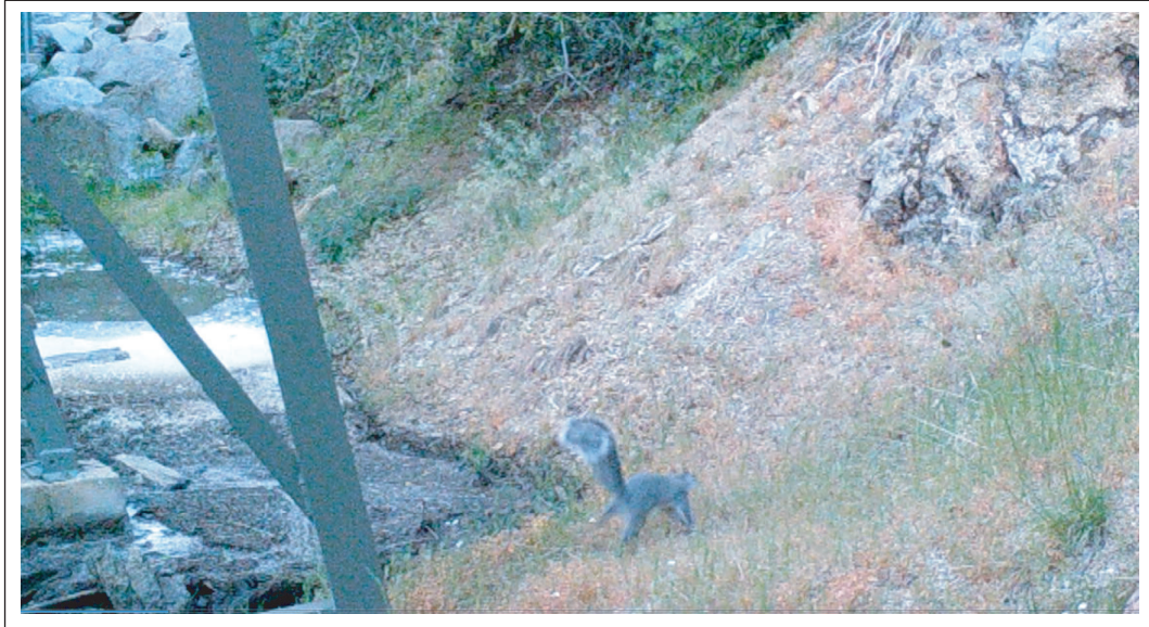
Photo 19: Western gray squirrel captured on wildlife camera 1, located along Salmon Creek on April 21, 2023.