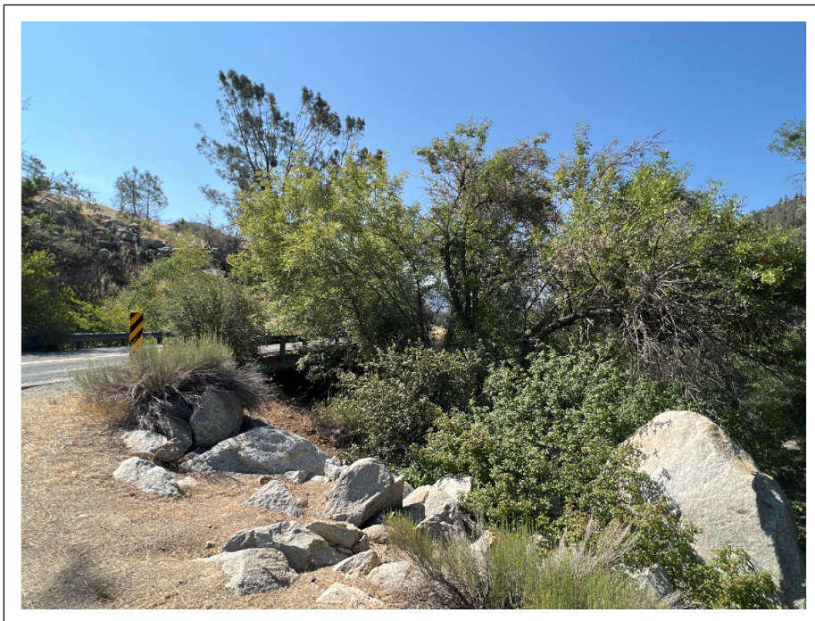
Photo 2: Riparian habitat located at the confluence of Salmon Creek and the Kern River.

D:\Projects\3\ERM\Kern3\MXD\General_Wildlife\3ERM_8x11_SP_GW.mxd