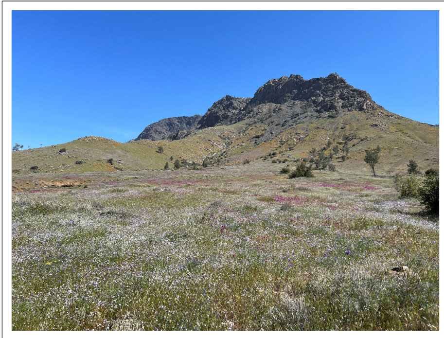
Photo 13: Grassland habitat suitable for California condor foraging, located in the southern portion of the study area, near Cannell Creek.