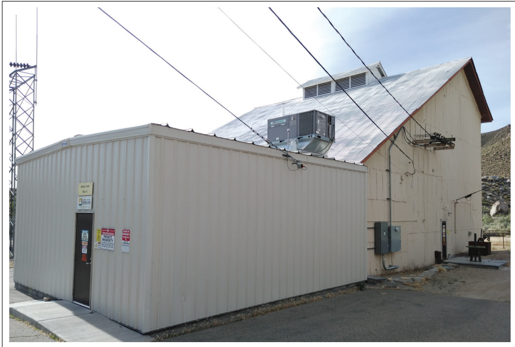
Powerhouse No. 5: Exterior view of the powerhouse facing southeast. The powerhouse is presumed to be supporting an active maternity roost.