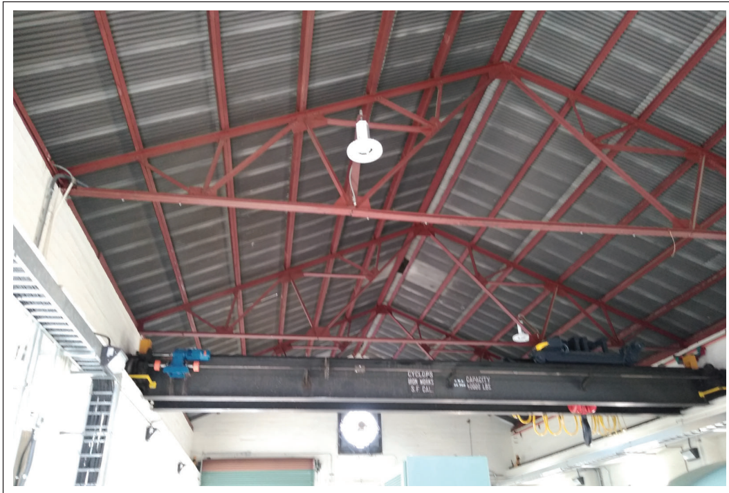
Powerhouse No. 3: Interior view of the powerhouse facing west. The roof and ceiling design are similar to Powerhouse 2 transformer shed, however, no evidence of day-roosting was observed.