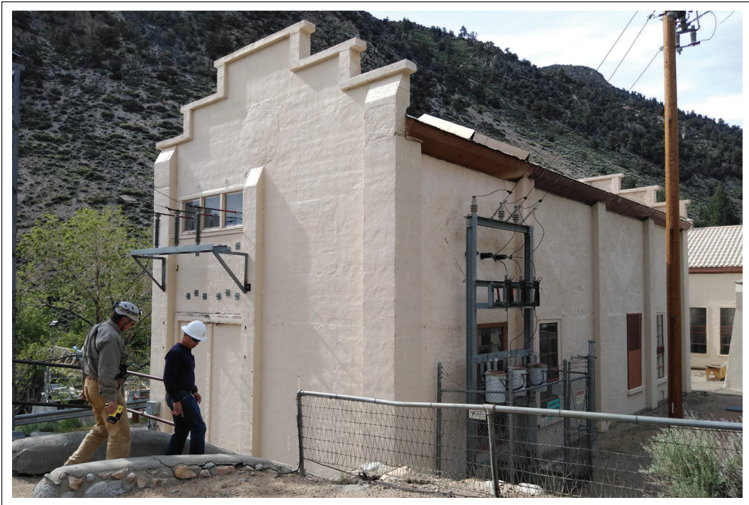
Powerhouse No. 2: Exterior view of the transformer shed facing southeast. The transformer shed is presumed to be supporting an active maternity roost.