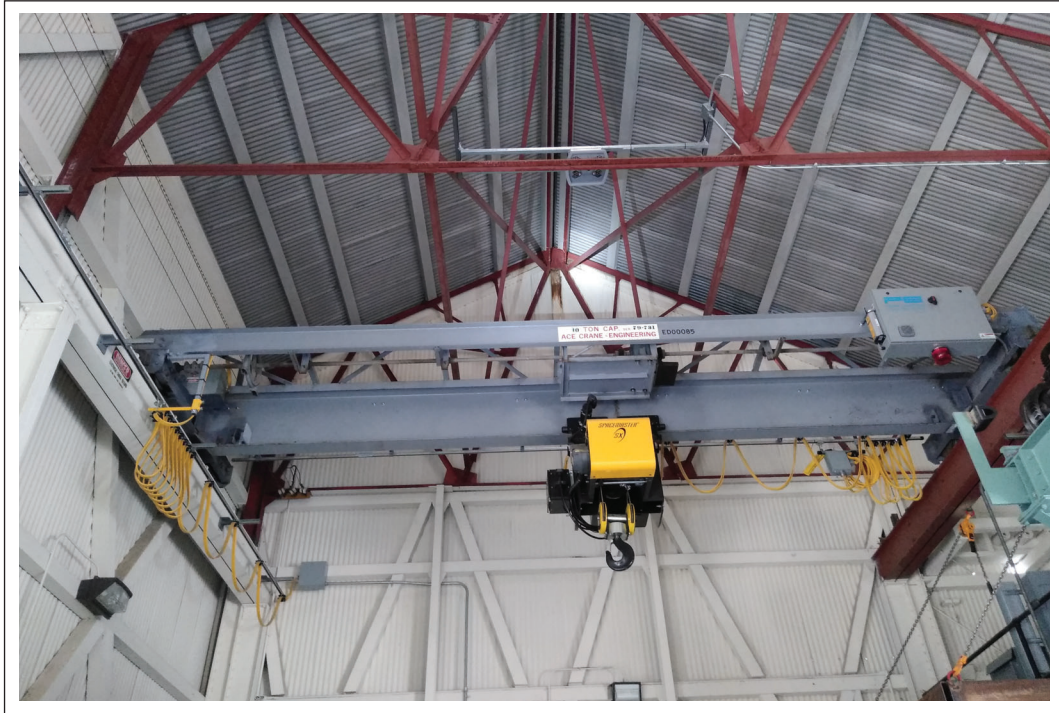
Powerhouse No. 5: Interior view of the powerhouse facing west. The active roost is located in the steel gusset at the peak of the roof highlighted by the flashlight beam in the photograph.

D:\Projects\3KLE\0102\Graphics\Bat HAVex_SP6_20190725.ai