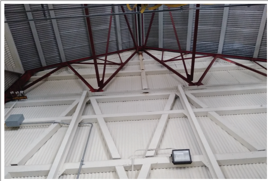
Powerhouse No. 5: Interior view of the powerhouse facing west. Guano accumulation is visible on the white beams below the roost in the dark gusset. Dark urine staining is also visible below the gusset.