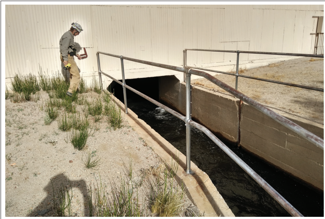
Powerhouse No. 5: View of the tailrace facing west. This larger tailrace does not completely inundate during facility flushing events leaving potentially suitable bat roosting habitat.

D:\Projects\3KLE\010102\Graphics\Bat HAVex_SF7_20190725.ai