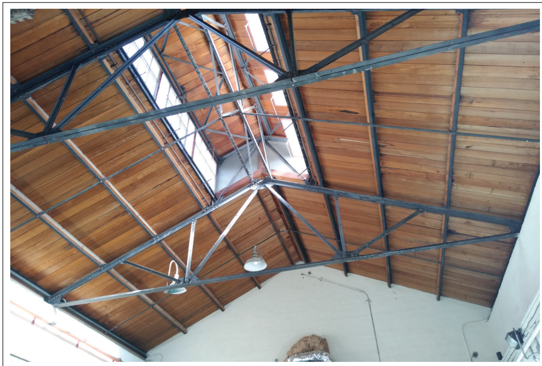
Powerhouse No. 6: Interior view of the powerhouse facing northwest. No sign of bat roosting was observed at this facility.