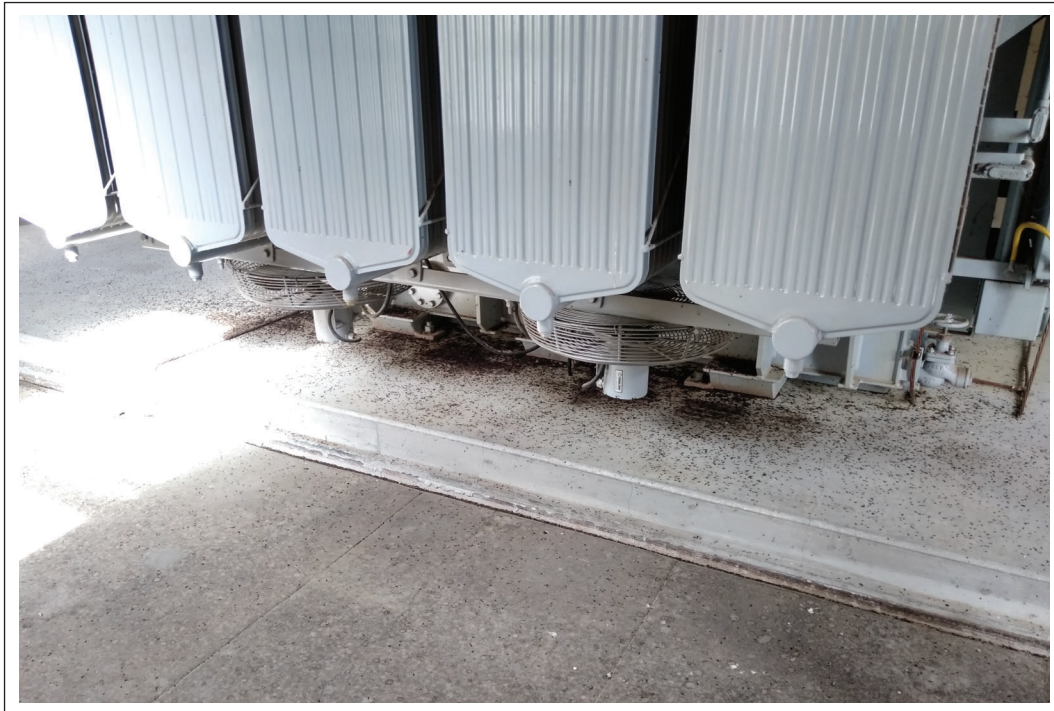
Powerhouse No. 2: Interior view of the floor of the transformer shed facing west. Substantial guano had accumulated below the equipment since it was last cleaned (likely within the last month).