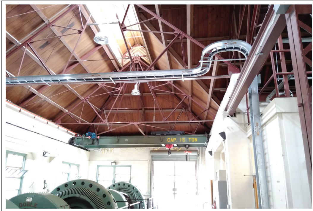
Powerhouse No. 4: Interior view of the powerhouse facing northwest. No sign of bat roosting was observed at this facility.