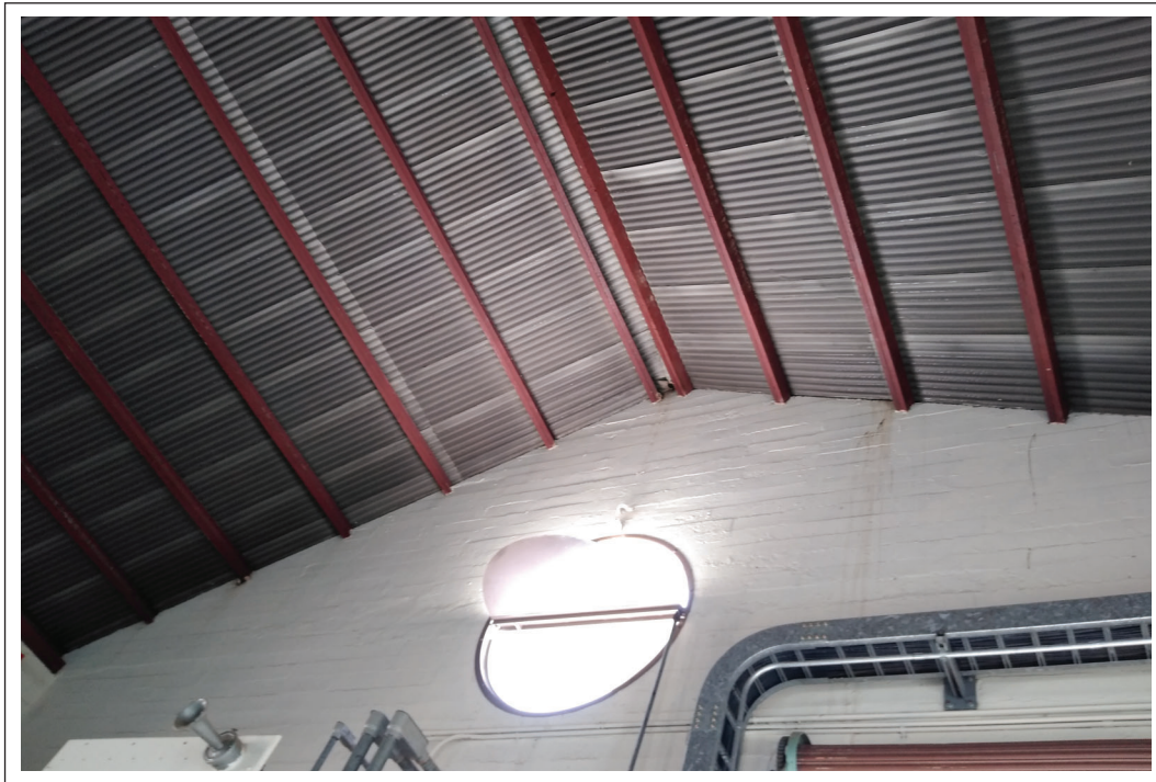
Powerhouse No. 3: Interior view of the powerhouse facing east. The circular vent present at many of the facilities is a good entrance/emergence feature for bats. Evidence of night roosting (urine staining) is visible on right side of photograph.