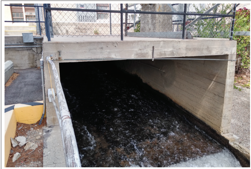
Powerhouse No. 4: View of the tailrace facing west. This larger tailrace does not completely inundate during facility flushing events leaving potentially suitable bat roosting habitat.

D:\Projects\3KLE\010102\Graphics\Bat HAVex_SP5_20190725.ai