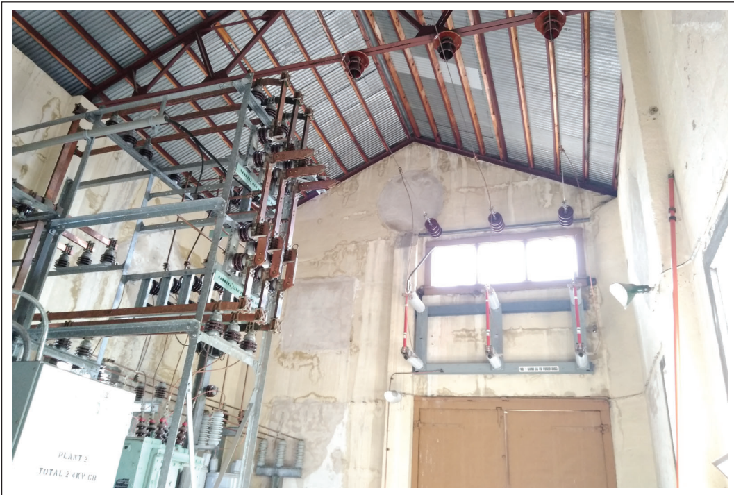
Powerhouse No. 2: Interior view of the transformer shed facing north. Bats were roosting inside the crest of the ceiling between the rafter beams.

D:\Projects\3KLE\0102\Graphics\Bat HAVex_SP1_20190725.ai