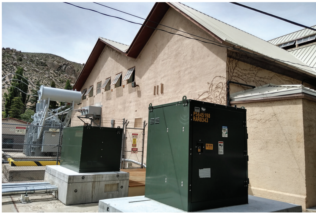
Powerhouse No. 4: Exterior view of the powerhouse facing south. No sign of bat roosting was observed at this facility.

D:\Projects\3KLE\010102\Graphics\Bat HA\lex_SP4_20190725.ai