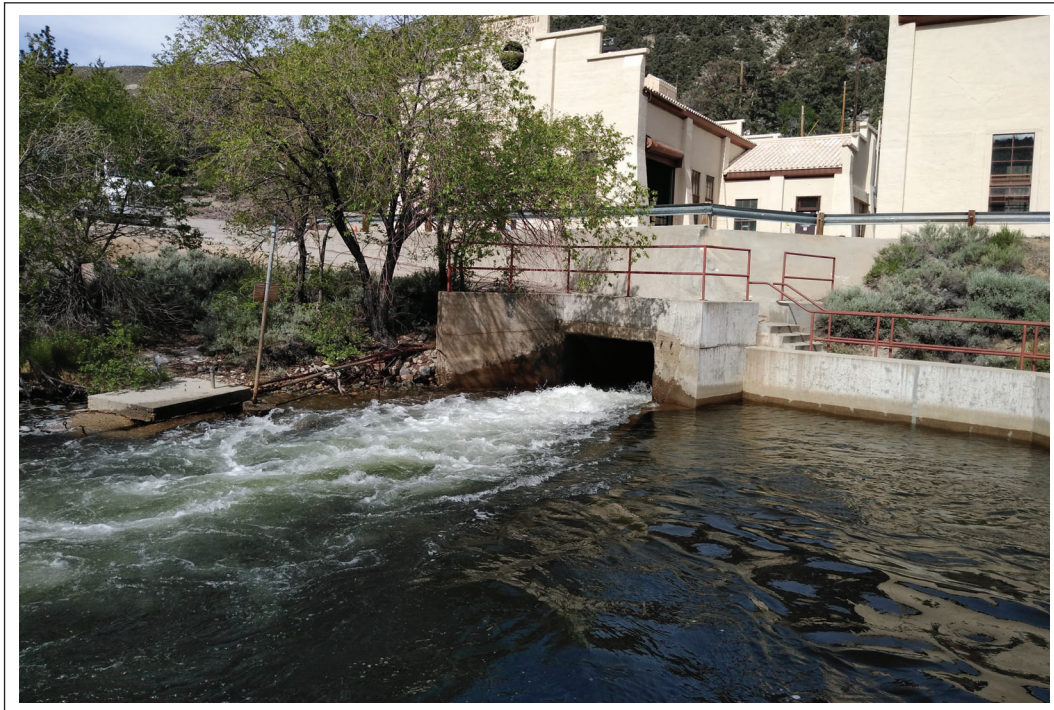
Powerhouse No. 2: View of the tailrace facing southwest. The volume of water expelled during facility flushing events does not completely inundate this tailrace leaving marginal suitable bat roosting habitat.

D:\Projects\3KLE\010102\Graphics\Bat HA\ex_SP2_20190725.ai