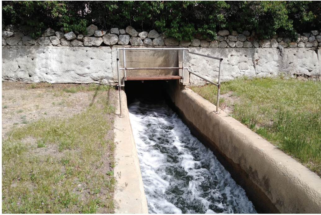
Powerhouse No. 3: View of the tailrace facing northwest. This smaller tailrace is completely inundated during facility flushing events and has no potentially suitable bat roosting habitat.