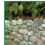
Natural Rock Planter Planter

The example screen effect shown above uses plants to screen a pad-mounted transformer. There are other kinds of screening that can be used, including but not limited to block walls, lattice fencing and the more traditional panel fences.