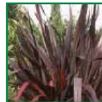
Phormium Atropurpureum Plant 1