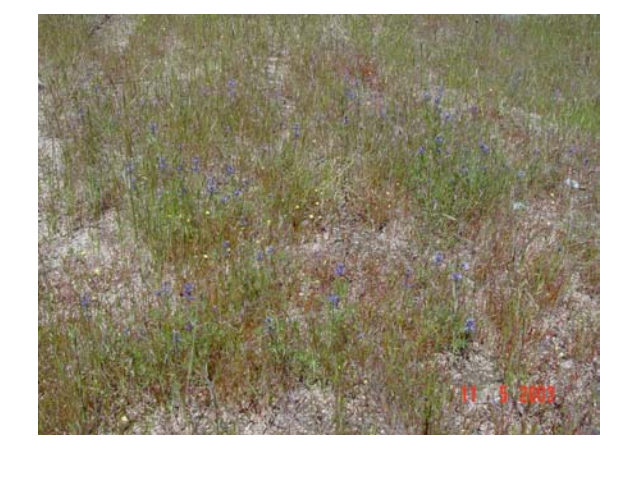
Cheatgrass along the Musick Distribution Line.