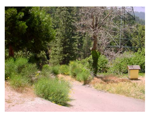
Spanish broom along East Incline Distribution Line at the road to Big Creek Powerhouse No. 1.