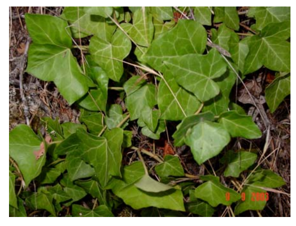
English ivy at the Eastwood School site.