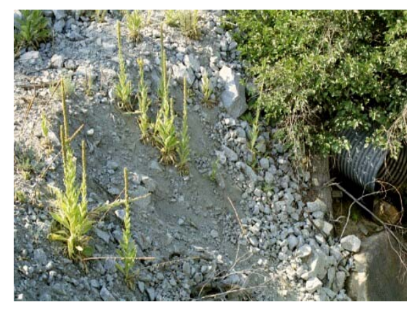
Woolly mullein at Camp 62 storage yard.