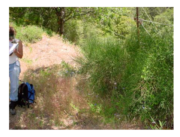
Spanish broom and cheatgrass above Big Creek Powerhouse No. 1 near the East Incline Distribution Line.