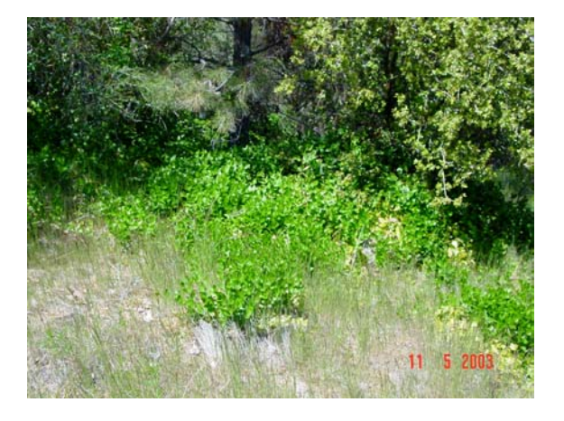
Periwinkle along the Musick Distribution Line.