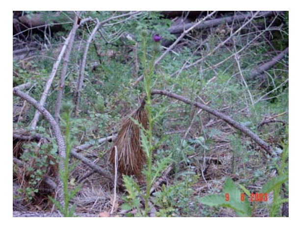
Bull thistle along Tunnel 5 near Adit 1.