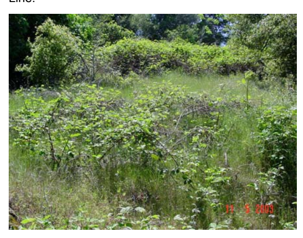
Himalayan blackberry at the Eastwood School site.