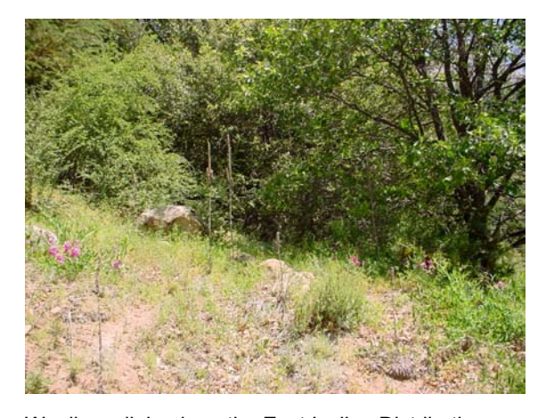
Woolly mullein along the East Incline Distribution Line.