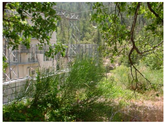
Spanish broom above Big Creek Powerhouse No. 1 near the East Incline Distribution Line.