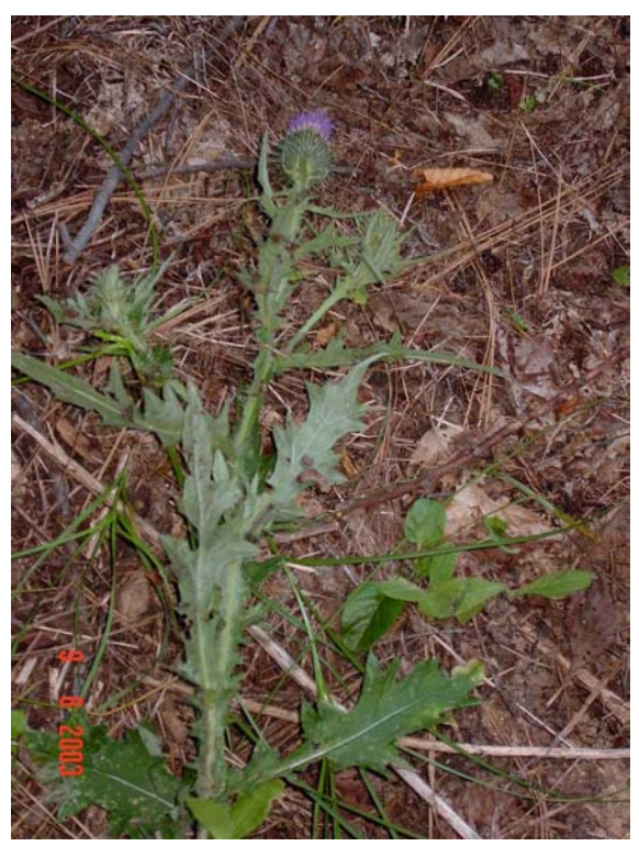
Bull thistle along Tunnel 5, Adit 1.