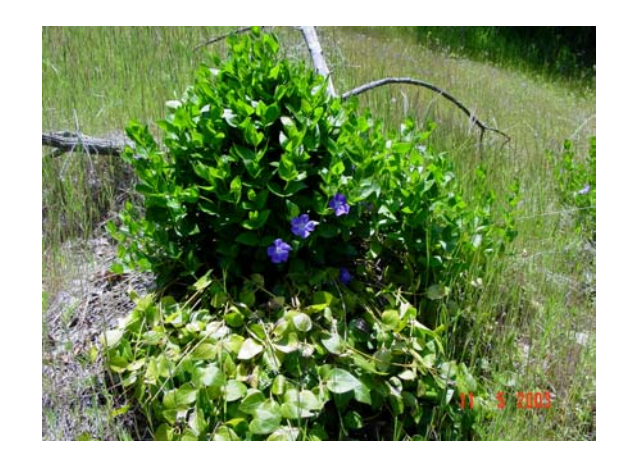
Periwinkle along the East Incline Distribution Line.