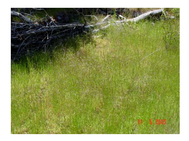
Cheatgrass at the Eastwood School site.