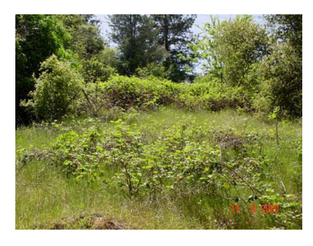
Himalayan blackberry and cheatgrass at the Eastwood School site.