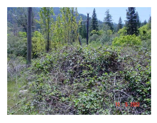
Himalayan blackberry along the Musick Distribution Line