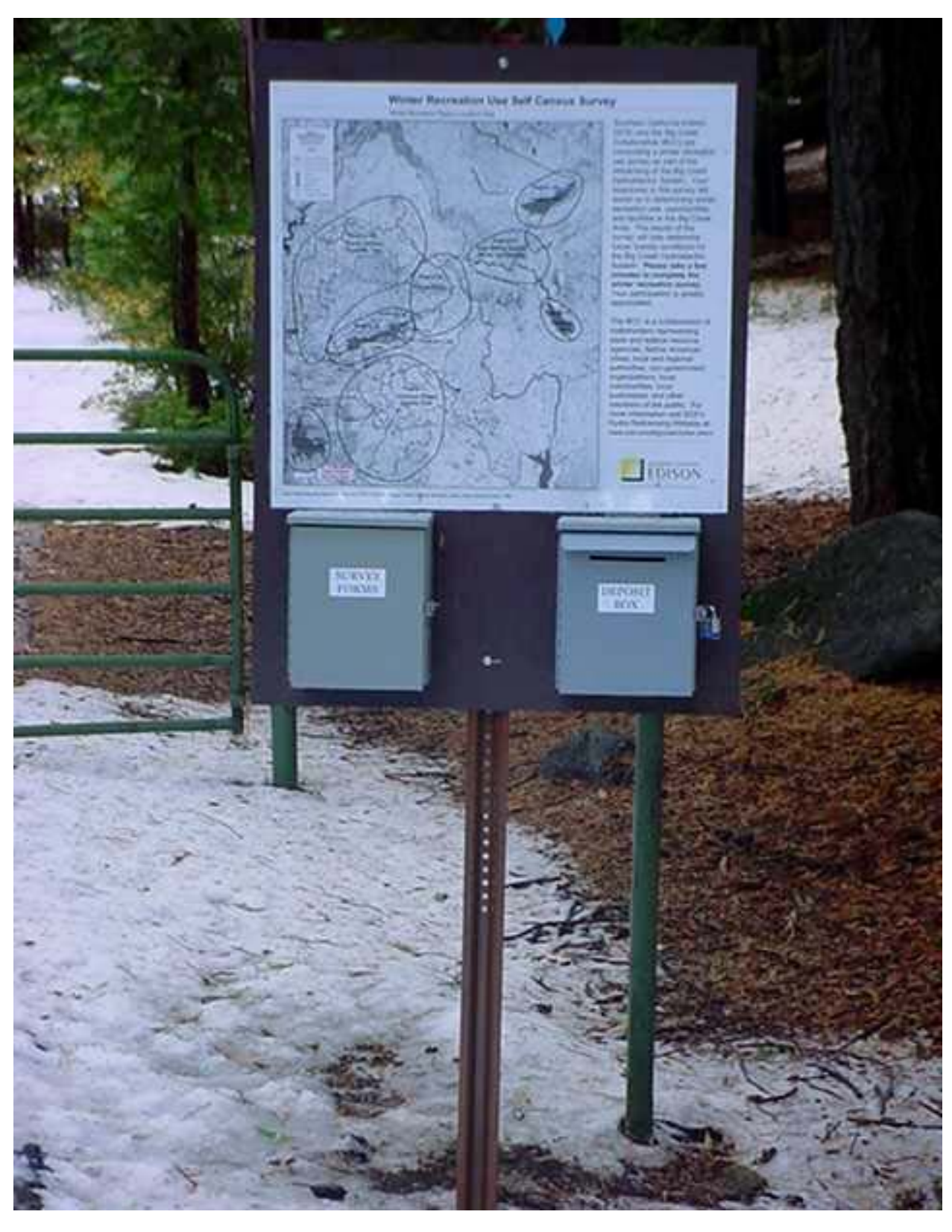
Figure REC-21-2. Winter Recreation Survey Self-Census Kiosk