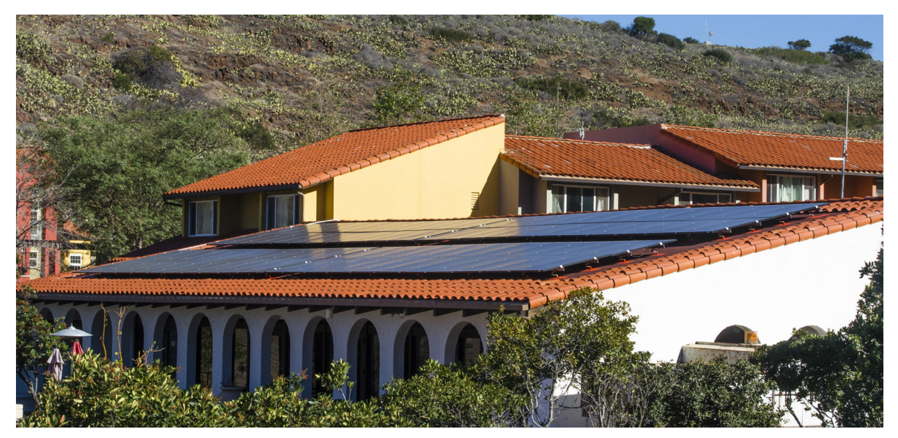
Solar panels at the USC Wrigley Institute for Environmental Studies, near Two Harbors.

Solar/energy storage was further modeled at various penetration levels, including: