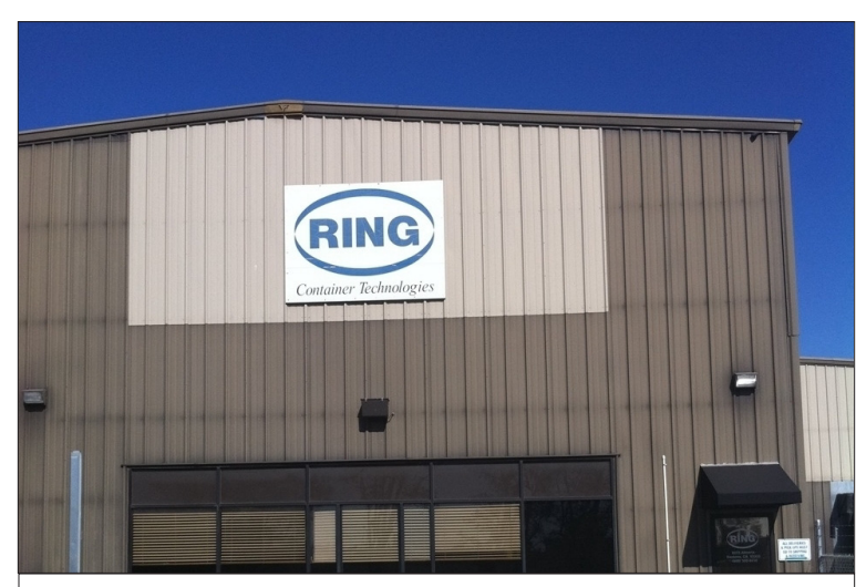
Nearly 218,000 kilowatt-hours in annual savings are the result of lighting and machine control upgrades made last year at the Fontana, Calif., plant of plastic container manufacturer Ring Container Technologies.

According to DeVries, Ring Container is focusing on three goals in its 2009-2014 sustainability plan: remaining energy neutral, reducing water consumption and achieving a zero-production floor waste.