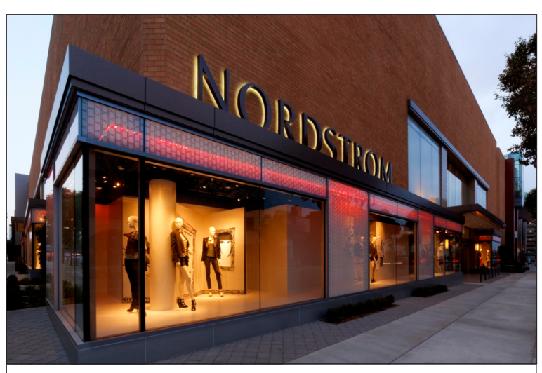
During Critical Peak Pricing events in summer 2010, Nordstrom stores in SCE's service territory reduced load by 20%, which equated to a reduction of over 2 megawatts.

He added, "Demand Response is really about making sure we don't have to build more power plants or tap into the higher-emitting coal plants. We know that in California, where we have customers and do business, it makes sense to use less energy on those critical peak days" to help avoid rolling blackouts and ensure customers have power at their workplaces and homes.