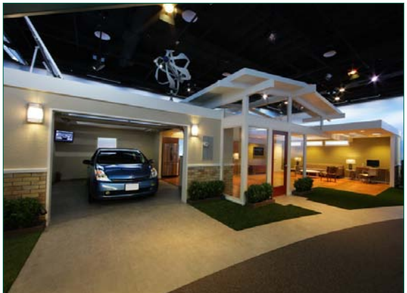
The new Smart Energy Experience at SCE's Energy Center in Irwindale provides insights into how Smart Grid technologies researched at SCE are creating a smarter, cleaner, reliable system for customers.

Guided tours of the 2,200-square-foot exhibit will be available by appointment starting in late August. CTAC attendees also will be able to take self-guided tours of the exhibit. Tours can be scheduled by contacting your SCE account representative or through the CTAC Scheduling Office at 626.812.7316 or ctacsche@sce.com.