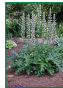
Acanthus Mollis Plant 1