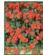
Impatiens Walleriana Plant 2

The example screen effect shown above uses plants to screen a pad-mounted transformer. There are other kinds of screening that can be used, including but not limited to block walls, lattice fencing and the more traditional panel fences.