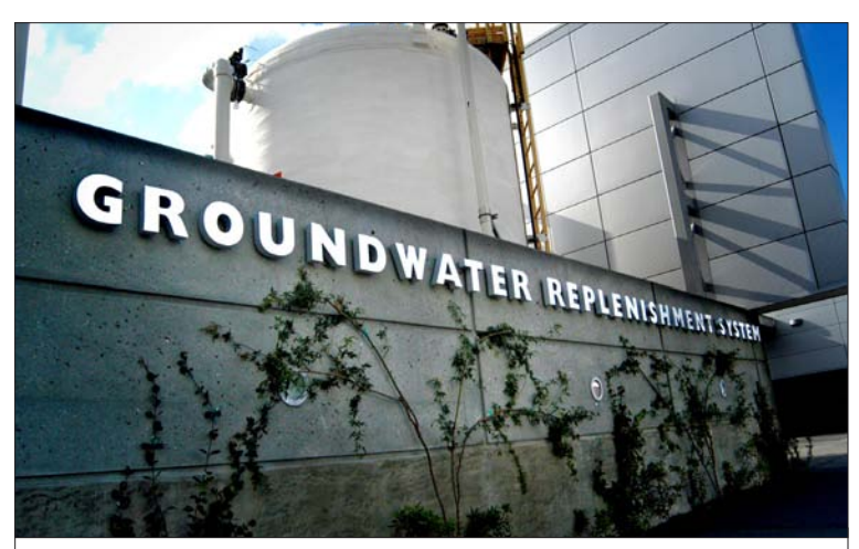
The Orange County Water District worked with SCE to maximize the energy efficiency of its Groundwater Replenishment System facility, earning an incentive of more than $420,000.

Several process areas within the GWR System use variable frequency drives which earned SBD incentives—to vary the rotational speed of the motors and thus adjust energy levels as needed during the water purification process.