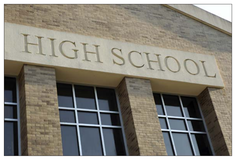
SCE provides a wide array of services, technologies and program offerings to help government and institution customers improve their bottom line.