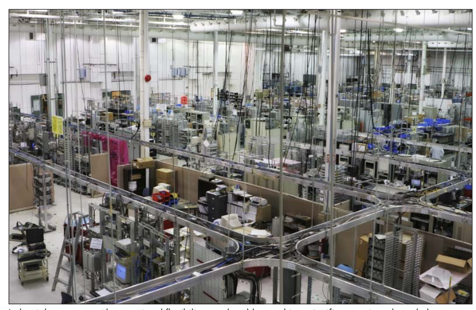
Industrial customers with operational flexibility may be able to achieve significant savings through the Critical Peak Pricing programs.

If you are in an industry – like plastics and foam products, fabrication, commercial printing, furniture and millwork production, among others – that has operational flexibility, you may be able to enjoy significant savings from the CPP programs.